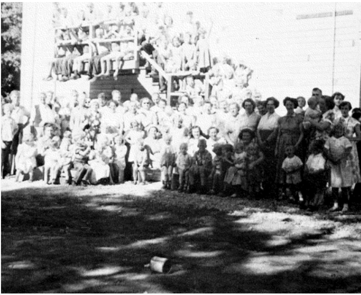
The school opening on September 5, 1955