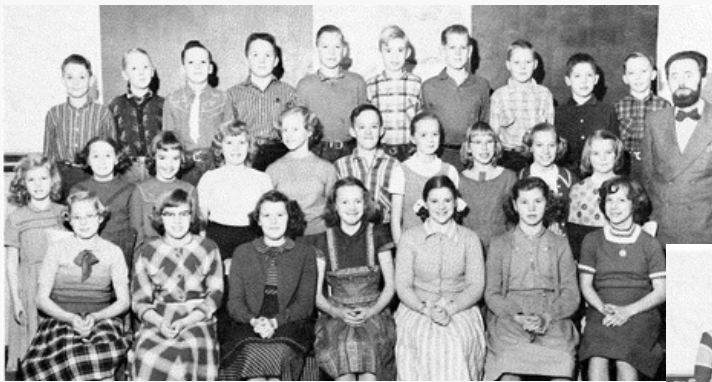
The older and younger classes with their teachers. Pictures taken around 1960.