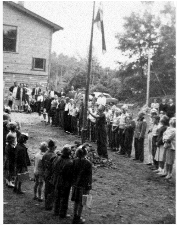
Bas deHaas raises the flag on the first day of school